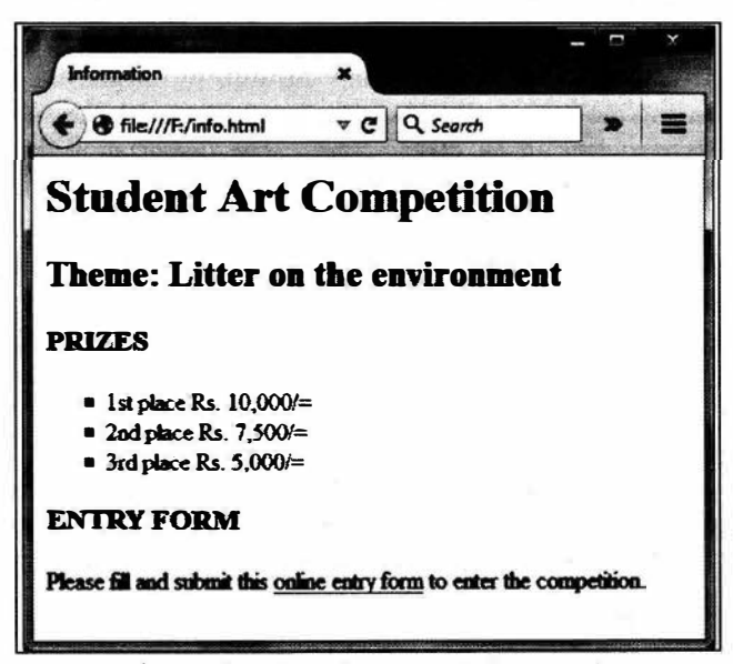
Figure 6.1: A web page of the website

6. Environmental Institute of Colombo intends to develop a website to provide information on an art competition for students. A web page from this website and another web page with the entry form to register for the competition are shown in the Figure 6.1 and Figure 6.2 respectively.