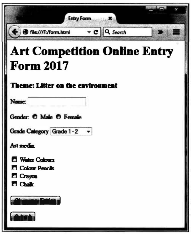
Figure 6.2: Entry form

(b) Using appropriate HTML tags, create an HTML file to render the entry form given in Figure 6.2. The options for 'Grade Category' are given in the Figure 6.3. Your code should satisfy the following requirements. When the 'Clear your Entries' button is clicked, all the entries of the form should be cleared. Similarly, when the 'Submit' button is clicked, the form should be submitted to the server.